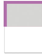
Horizontal Half Page 7.5" x 4.875" 8.75" x 5.75" Bleed